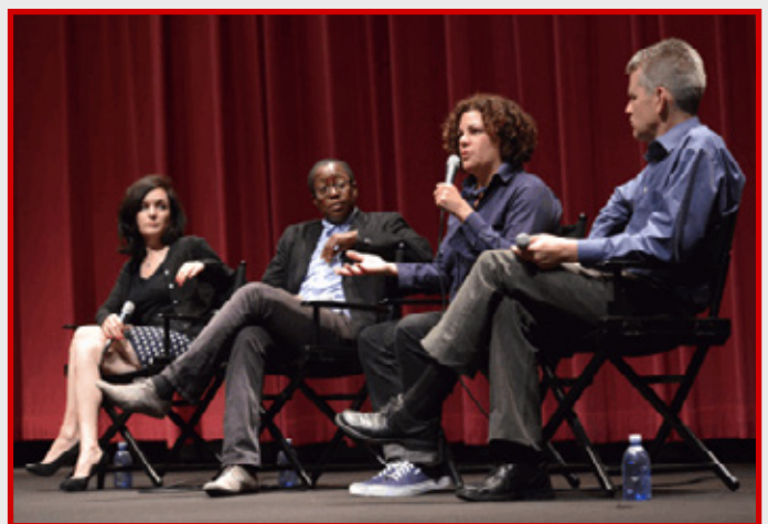
Above: Post Screening Q & A with filmmakers