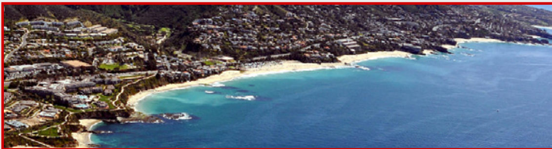
Above: Site of the 2013 AJK Fundraiser

For the first time since 2006, when the Foundation premiered “Coming Attractions: The History of the Movie Trailer” at the Academy of Motion Pictures Arts & Sciences Mary Pickford Research Center, we will be hosting a special event.