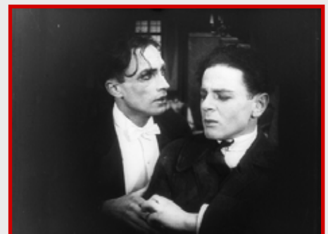
Above: Scenes from TAXI ZUM KLO (1980), THE QUEEN OF SHEBA MEETS THE ATOM MAN (1963) and DIFFERENT FROM THE OTHERS (1919)