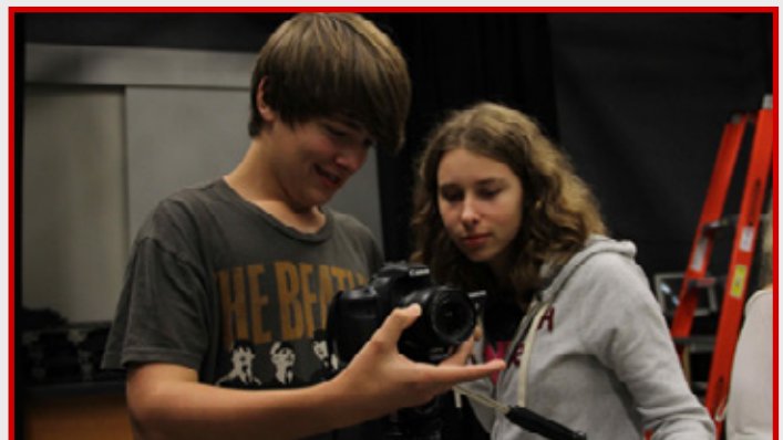
Above & Left: Students at work in the Film And Television Conservatory