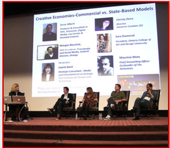
Right: A Panel of Producers & Scholars at the Third Annual Transmedia Hollywood Symposium