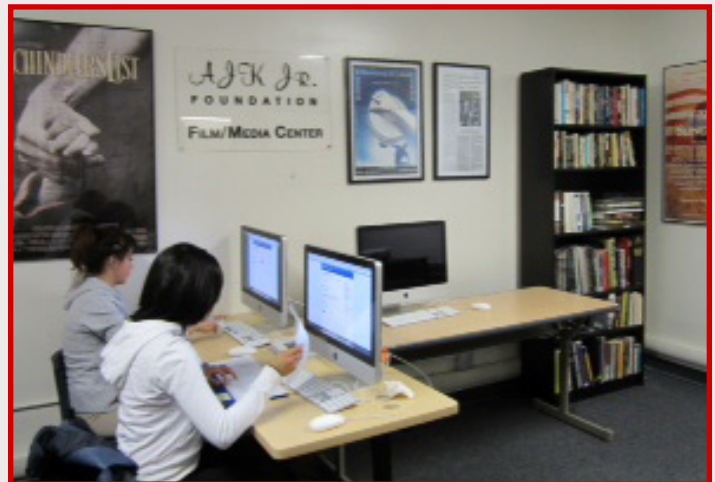
Above: Students working in the AJK Foundation Film and Media Center